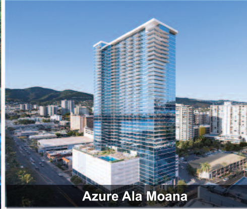
Azure Ala Moana